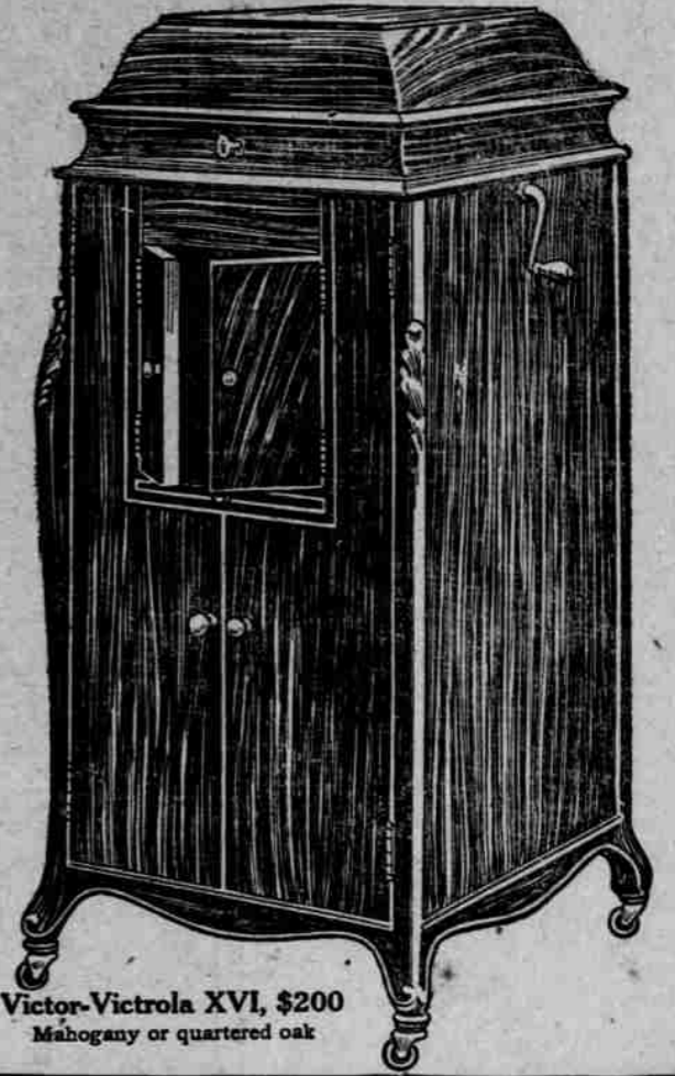
Victor-Victrola XVI, $200 Mahogany or quartered oak

Victor Talking Machine Company Camden, N. J.