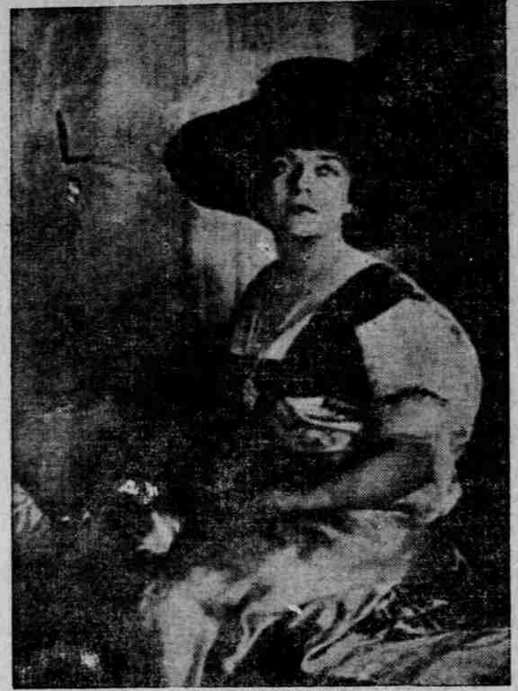
MRS. ALICE ROOSEVELT LONGWORTH.