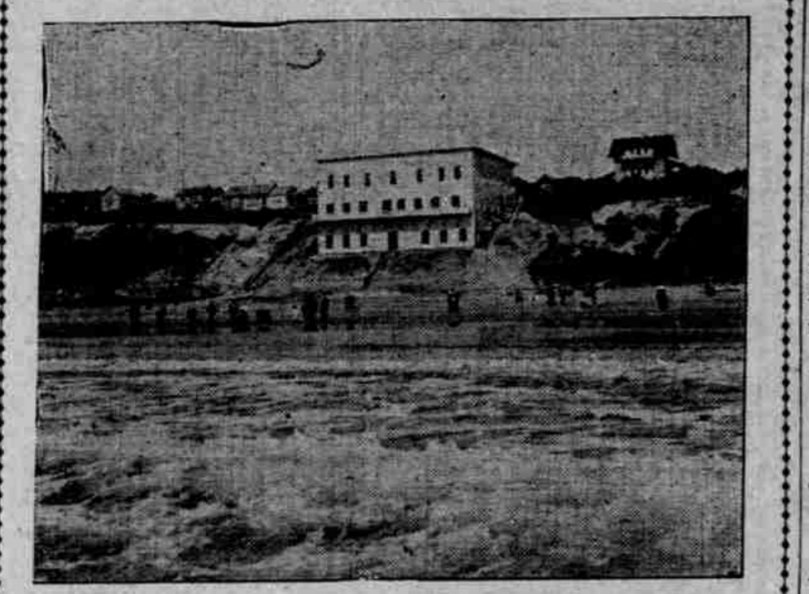
NICOLAI HOTEL FROM THE OCEAN.