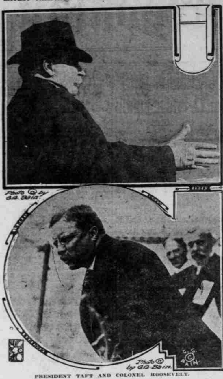
PRESIDENT TAFT AND COLONEL ROOSEVELT.