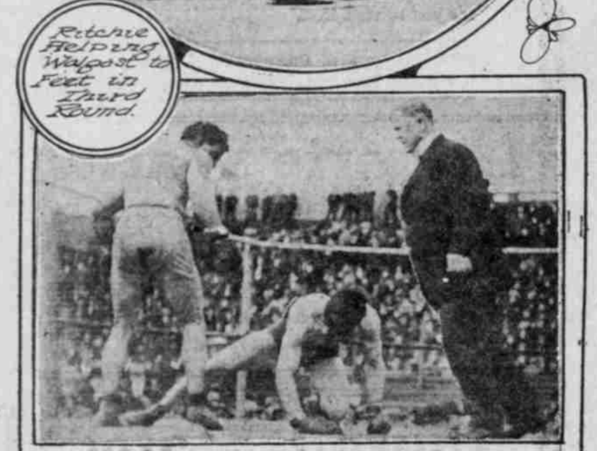
Retire Down - Referee Just Walk to Right.