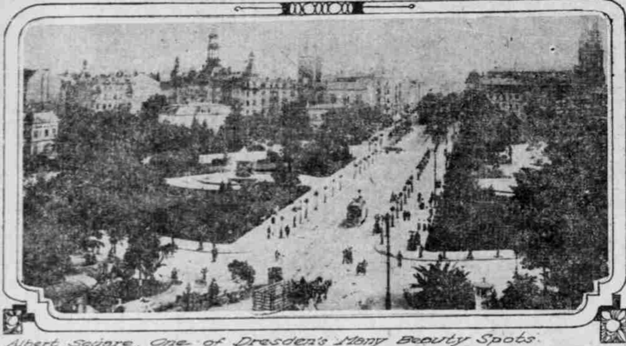
Albert Seiere, One of Dresden's Many Beauty Spots.