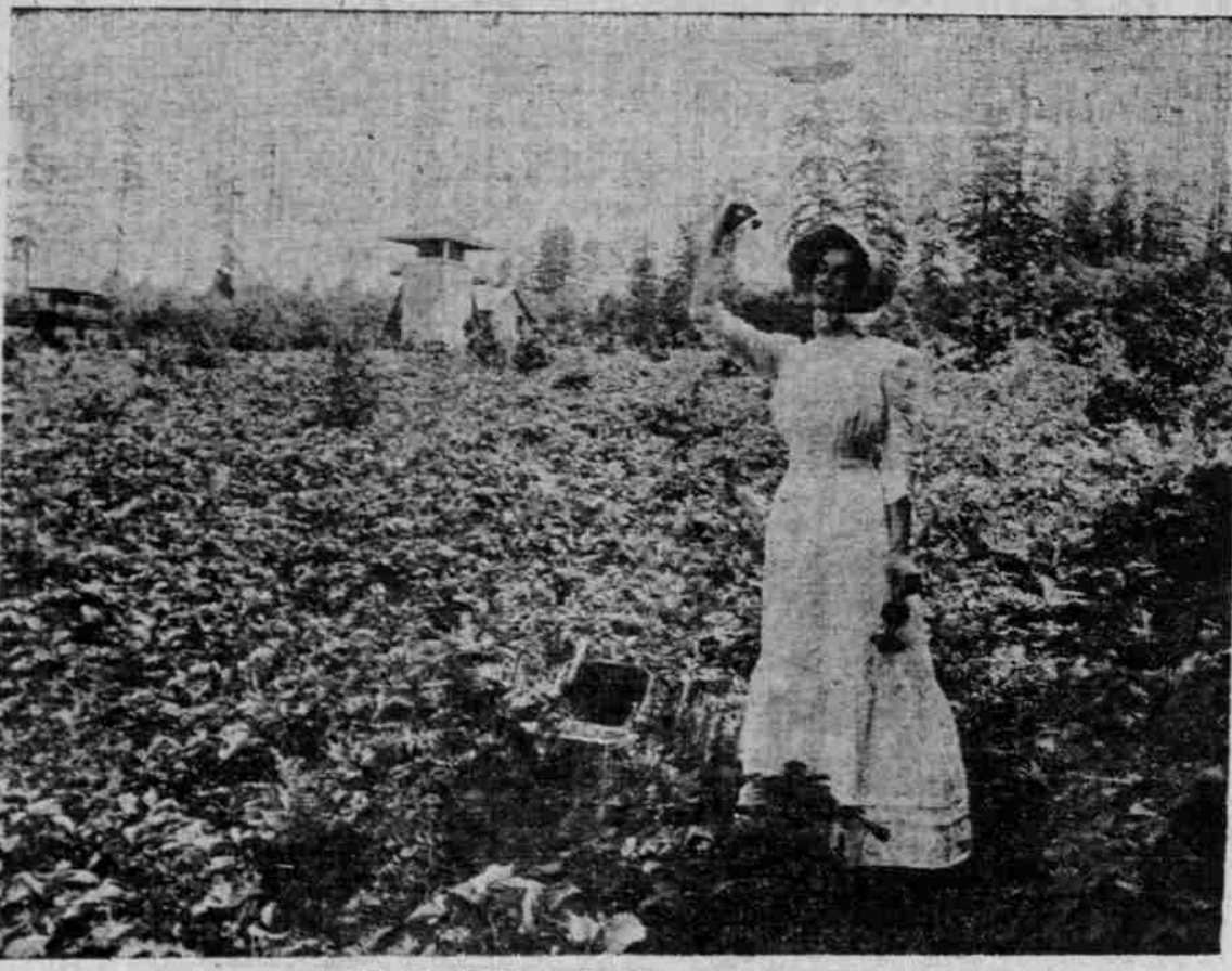
"Lady Midst the Strawberries."

"On logged-off and other lands all kinds of berries yield big profits. 250 crates of loganberries have been taken from one agre and sold at $3 per crate. Loganberries yield as high as 350 crates to the acre and blackberries produce as high as 8 tons to the acre."