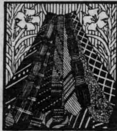
MAIL ORDERS FILLED.

Fine Spring and Summer weight Lisle Union Suits, with long or short sleeves, knee or ankle length. Full fashioned—form-fitting. Eerie, salmon, blue or white. They are splendid $1.50 Union Suits. In all sizes, 95c For today, special, a suit