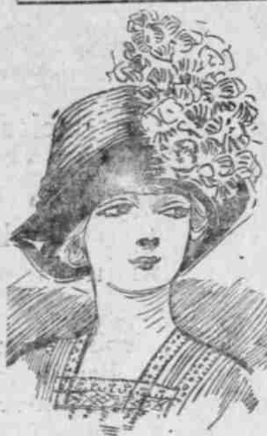
ORDER BY MAIL

We have taken unusual care in selecting our stock of Hat Shapes. We aim to make every one that goes out, send back two new customers.