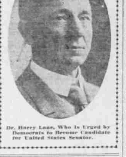
Dr. Harry Lane, Who is Urged by Democrats to Become Candidate for United States Senator.

Plans Being Made Here to Entertain Wisconsin Man for Projected Visit During April—Ultimate Victory Yet in Balance.