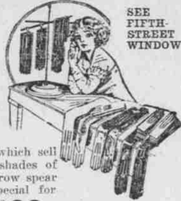
SEE FIFTH-STREET WINDOW

$3 and $3.50 'Kayser' Silk Gloves for $1.19 Every pair bears the well-known Kayser label in the hem! Beautiful 16-button length Silk Gloves with handsome embroidered and beaded designs. Choice of white, black, champagne, gray, chamamois, pongee and tan. Size 6½ only. These Gloves positively are $3 and $3.50 grades; while lot lasts, $1.19 $1.50 Trefousse Kid Gloves, 98c A special purchase direct from Trefousse & Co., of their famous oak tan Cape Gloves, which sell regularly at $1.50. Assorted shades of tan, one-clasp style with three-row spear backs. Sizes 6½ to 7¼. Special for the 1153d Friday Surprise Sale today at low price of, the pair, 98c