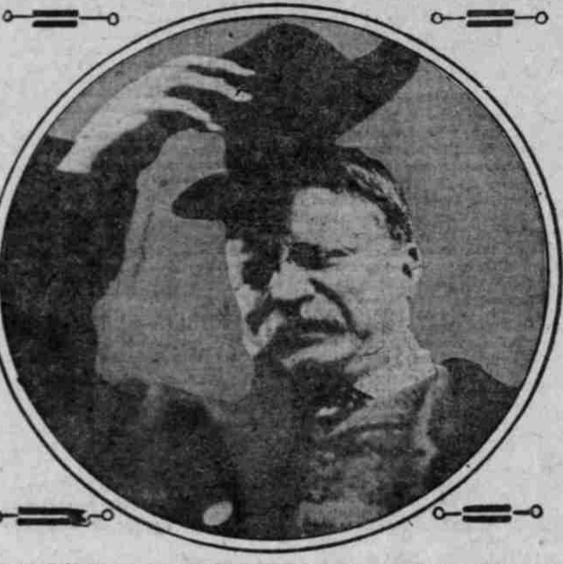
TWO SNAPSHOTS OF THE EX-PRESIDENT TAKEN LAST WEEK WHILE HE WAS IN OHIO TRIP.