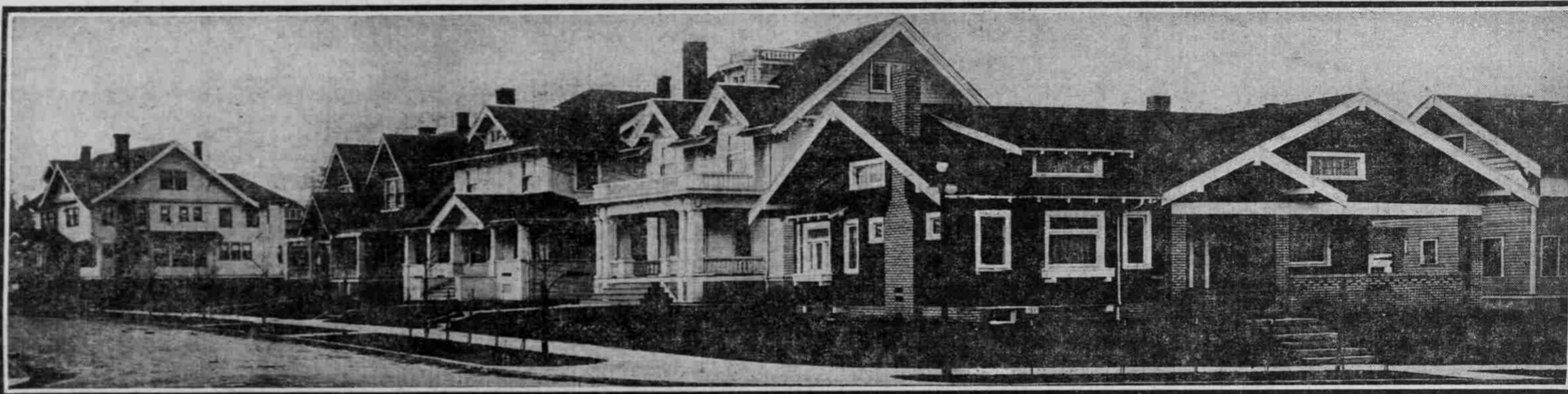
STREET SCENE IN LAURELHURST, SHOWING THE COMPLETED STATE OF THE ADDITION NOW.

The special building discount of 15 per cent on Laurelhurst lots has just 30 days more to run. March 15 this discount will be discontinued and it will not be put in effect again. Those contemplating taking advantage of the discount should delay no longer in selecting a building site, as interest will not commence on new contracts until March 15, and first deferred payments will be due 30 days from that date. Therefore make your selection now and get the best locations. Since January 1, 75 lots have been sold to home-builders in Laurelhurst. Our sales for the next 30 days will be limited to 200 lots, with discount and second mortgage privileges. This will pretty well close out the company's holdings, and then if you want a home in Laurelhurst you will have to pay an advance to an original buyer. We are now closing deals with builders for nine, ten, twelve and fourteen lots each. At this rate the 200 limit will soon be reached.