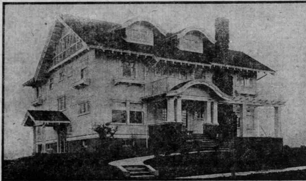
ELEGANT NEW HOME IN LAURELHURST

Over 300 handsome homes erected in one addition in one year is a remarkable record even for Portland, yet this was achieved in Laurelhurst last year. There is every assurance at this time that fully 400 new homes will be built in the addition this year. This enormous building activity will greatly increase values in the tract. Compare prices in Laurelhurst with those in other high-grade residence additions and you will find that Laurelhurst is from 25 to 50 per cent lower in price.