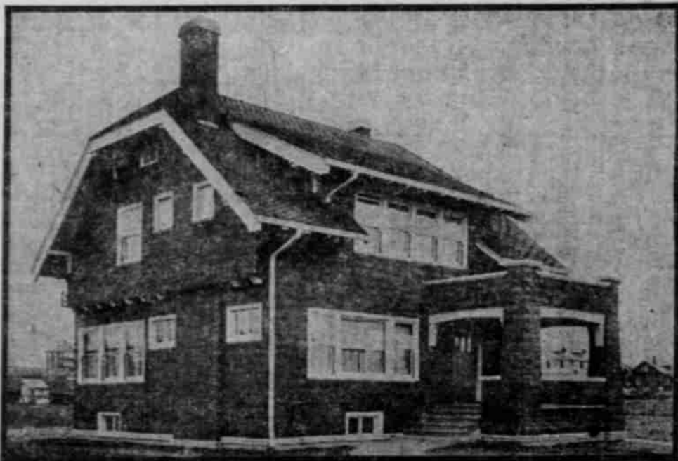
E. G. GORDON'S BUNGALOW IN LAURELHURST.

In selecting a site for your home there are two important considerations that must be borne in mind. One is to choose a desirable place to live, and the other is to make a good investment. Don't overlook the investment feature. It is of vital importance.