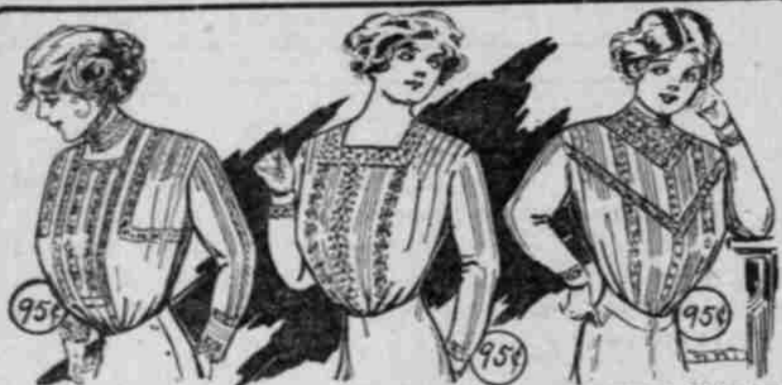
FOR THE 1147TH FRIDAY SURPRISE SALE

A glance at the captions below—at once you feel the power of these crowd-bringing offerings we've secured for the 1147th Surprise Sale! Shirts---8000 of them---at 49c instead of $1 and $1.25! Fresh, crisp, new $1.50 Spring Waists at 95c! All our Velvet and Corduroy Suits for women at less than cost to make! Finest $3.50 and $4 Long Kid Gloves at $1.87! And many more just as phenomenal. Read all the details below—Remember, these are all sales for one day, Friday, only! EVERY ARTICLE REDUCED, EXCEPT CONTRACT GOODS—a radical offer which ends with the Clearance Tomorrow night!