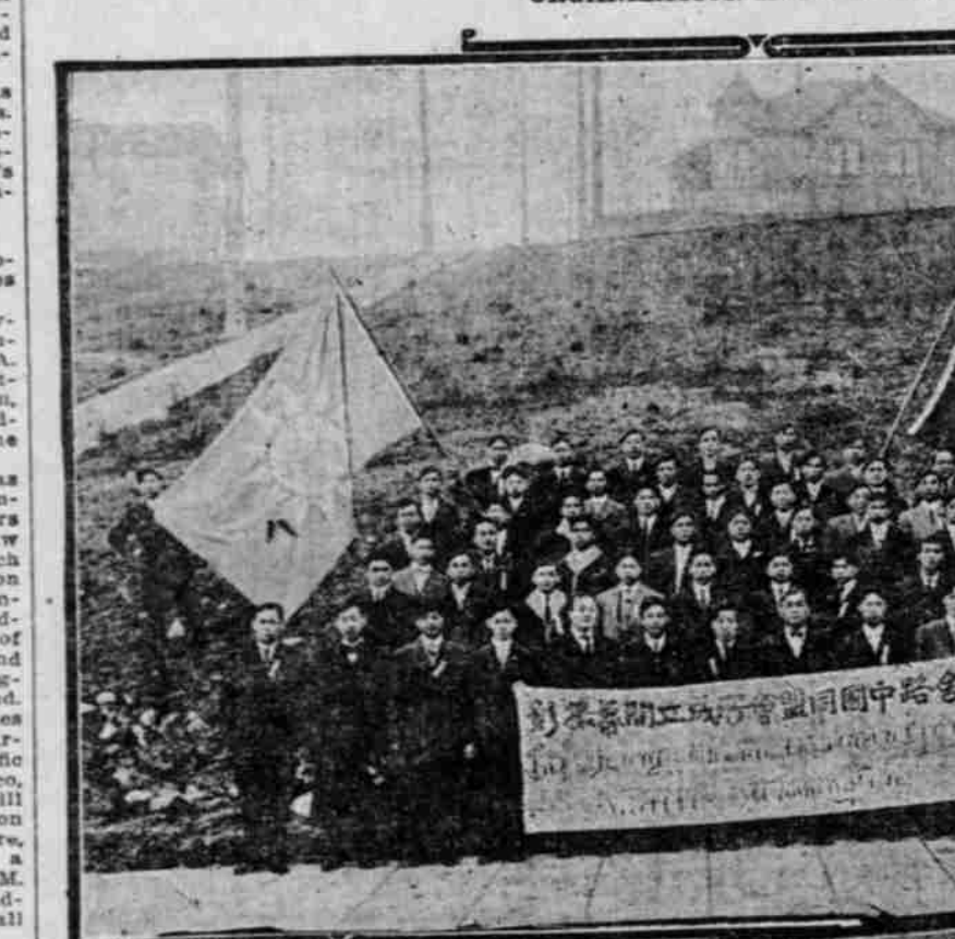
THE YOUNG CHINESE ASSOCIATION OF SEATTLE

YOUNG CHINA ASSOCIATION OF SEATTLE AND NURSES WHO ARE AFFILIATED WITH SIMILAR ORGANIZATION IN PORTLAND.