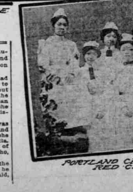
PORTLAND CHINESE GIRLS RED CROSS CORPS