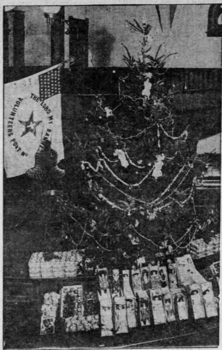
SOME OF PRESENTS DISTRIBUTED BY VOLUNTEERS OF AMERICA.

CHRISTMAS TREE AT SECOND BAPTIST CHURCH, WHICH DE-LIGHTED HUNDREDS OF CHILDREN.