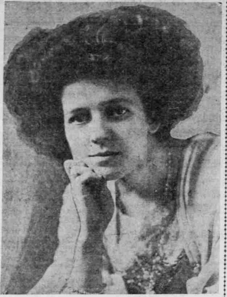
MRS. A. G. VANDERBILT, FORMERLY MRS. MARGARET EMERSON MCKIM.