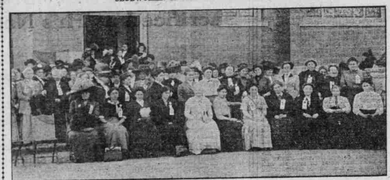
GROUP OF DELEGATES TO THE STATE FEDERATION OF WOMEN'S CLUBS.