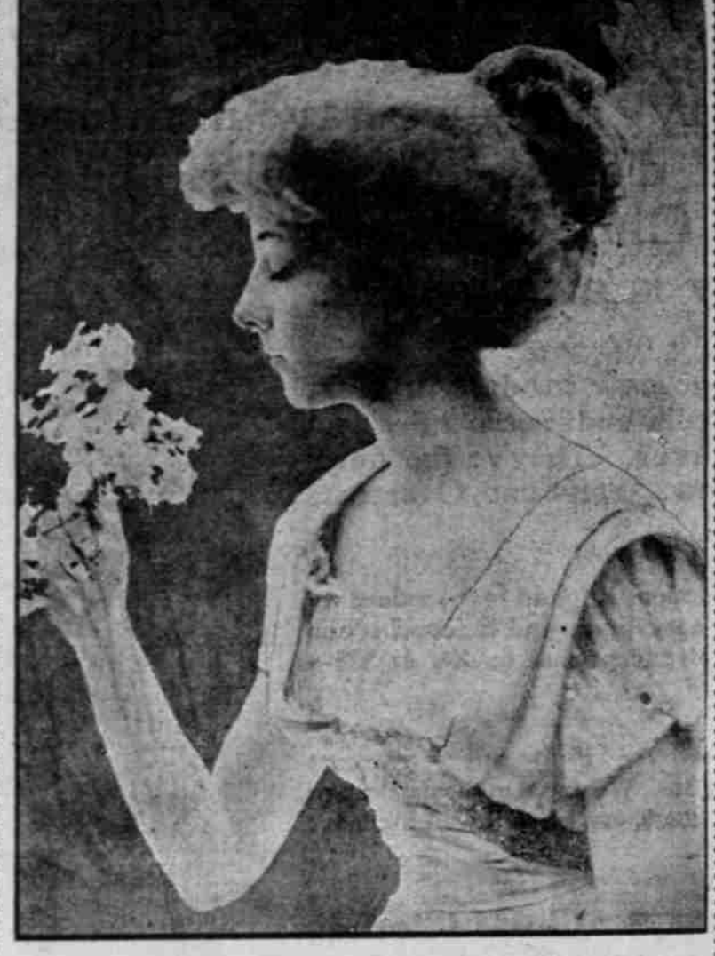
DUCHESS VIZEN, FORMERLY MISS ANITA STEWART.