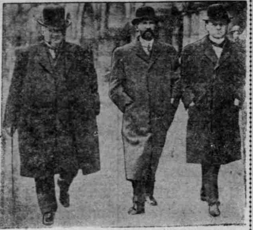
LEFT TO RIGHT, SENATOR W. B. HEYBURN, OF IDAHO, GEORGE SUTHERLAND, OF UTAH, AND ATEE POMEERNE, OF OHIO.