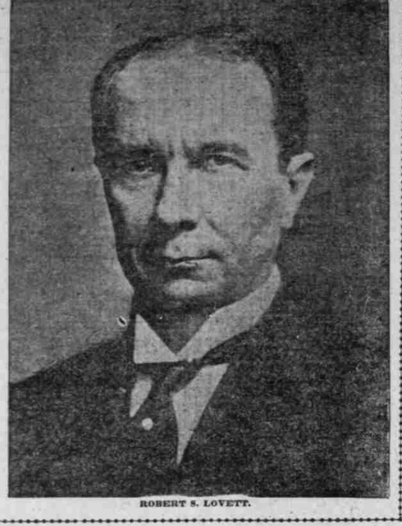
ROBERT S. LOVETT.