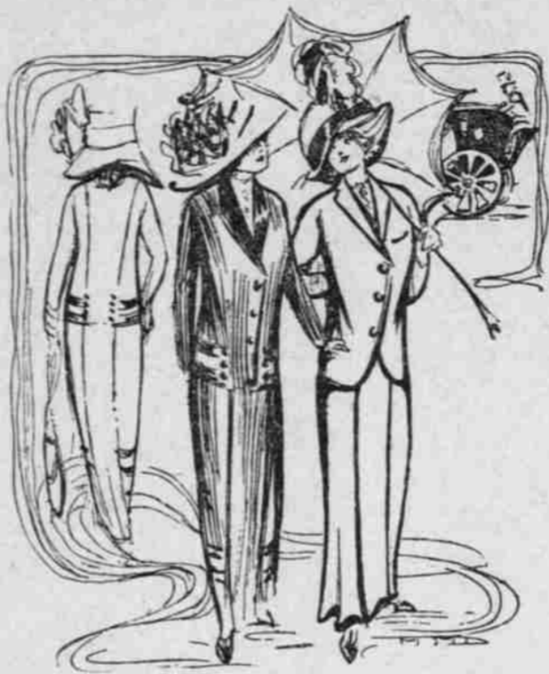
Exactly Like Illustration

—These suits are displayed in our windows and in the suit department, but none will be sold, none sent C. O. D., no mail orders, or sent on approbation.