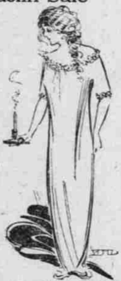
Just Like Picture

—Ladies' cambric and long cloth corset covers, cut circular neck, trimmings and embroidery, insertion, beading, ribbon, also rows of lace and insertion in back and front.