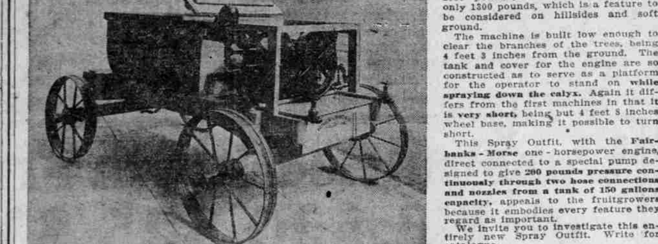
FAIRBANKS, MORSE & COMPANY. FIRST AND STARK STREETS, PORTLAND, OREGON.

ESPECIALLY CONSTRUCTED TO MEET THE REQUIREMENTS OF THE FRUIT GROWERS OF THE NORTHWEST.