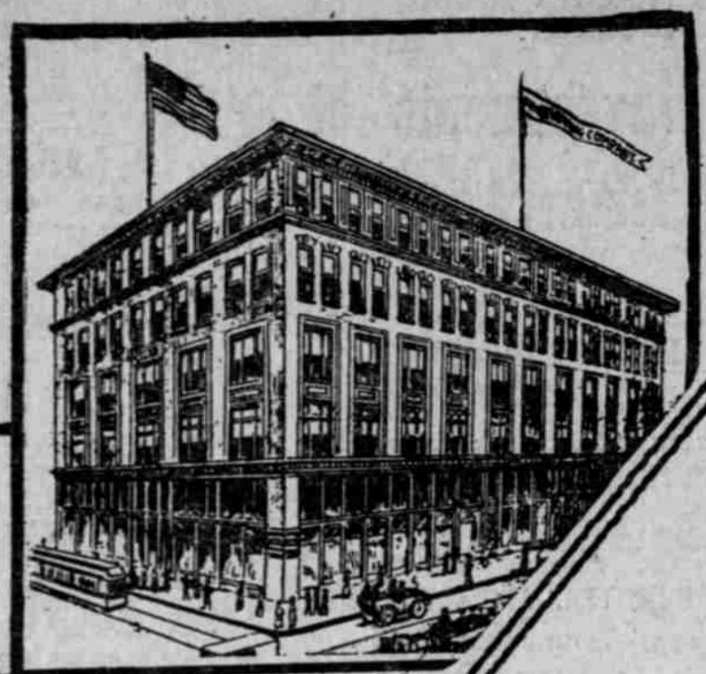
MAIN BUILDING ERECTED - 1898

ROSEBROOK'S famous Heilig Theater Orchestra will play the "Kermis" Dance Music today in our big 7th floor Restaurant, including selections from "The Hungarian Dances," "The Seasons," "The London Chappies," "The Gondoliers," and others. Splendid a la carte menu—prompt service.