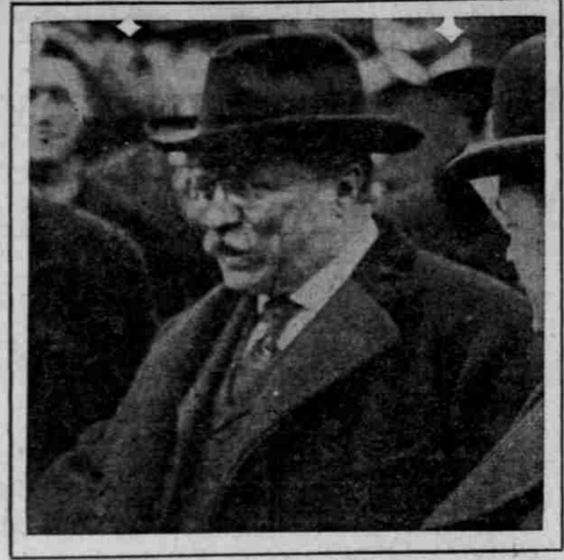
THEODORE ROOSEVELT, EX-PRESIDENT OF THE UNITED STATES.

noon of May 21, 1902, the cornerstone of the Lewis and Clark monument at the City Park. His address on that occasion was commendatory of pioneers and he also appealed strongly for support for the Navy, the Secretary of which, W. H. Moody, was a member of his official party.