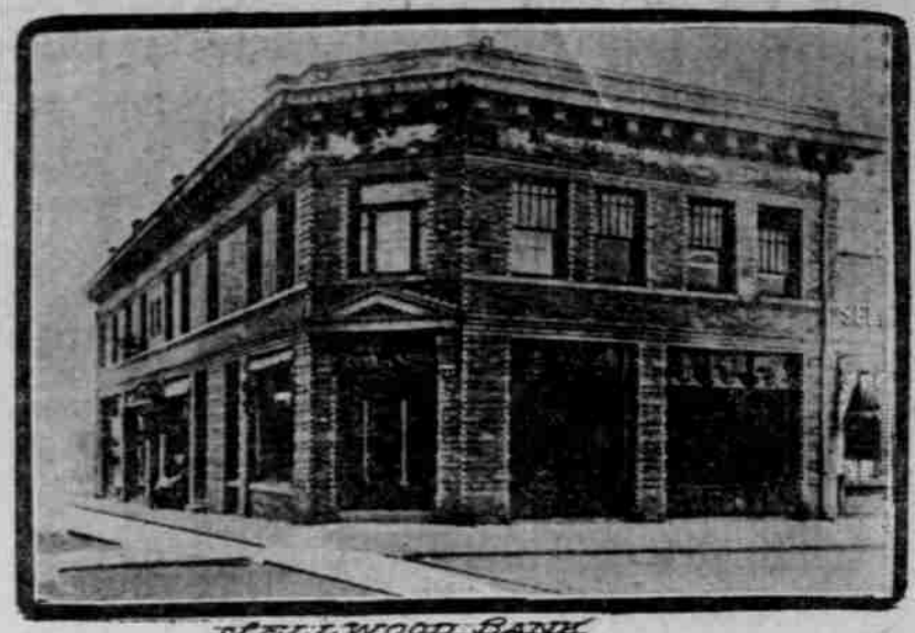
SCENE OF ATTEMPTED ROBBERY, WAY MASKED MAN ENTERED BUILDING, AND JANITOR, SURPRISED BY ROBBER.

Outlaw Cuts Hole in Floor to Gain Entrance to Building, Surprising Janitor—He Loses Nerve Before Finishing Work.