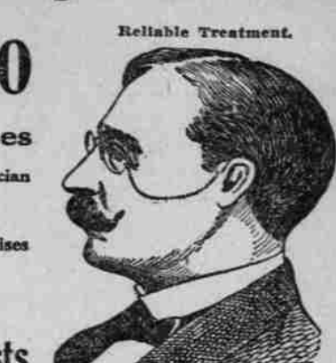
"You Need My Advice"

Historic Residence Destroyed Early Sunday Morning.