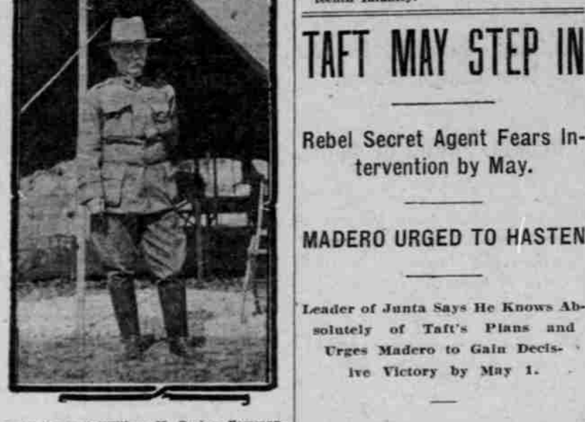
Major-General William H. Carter, Commander, in Front of His Tent.

The main garrison at the Canada ranch, about one mile from Ojinaga. The soldiers sought shelter in several houses, which have been surrounded. On the riverfront the customs guardhouse, held by the federals, and are now very close to the troops. At this point firing continued at intervals both day and night. Three insurgents have been killed on the river bank.