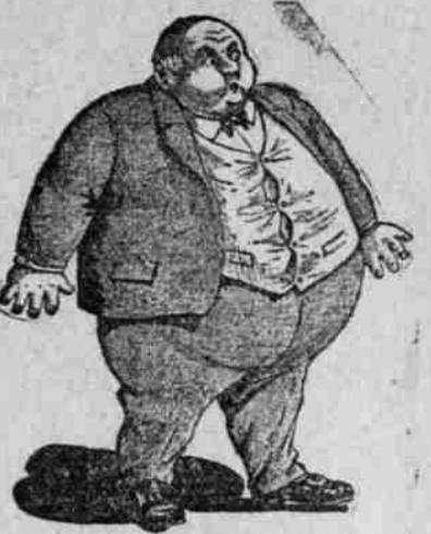
Inflation Of The Stomach From Undigested Food Quickly Relieved By A Stuart's Dyspepsia Tablet.

A Trial Package Sent Free On Request. All of the unpleasant sensations attendant upon eating too heavily are instantly relieved by Stuart's Dyspepsia Tablet. Like sticking a pin into a rubber balloon. The reason is simple and easy to understand.