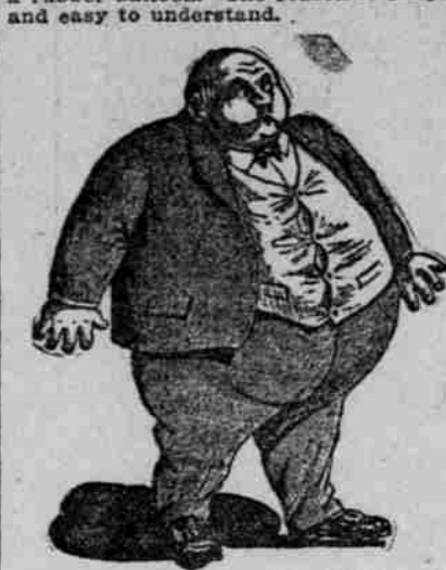
ion Of The Stomach From Undiges Food Quickly Relieved By A Stuart's Dyspepsia Tablet.

A Trial Package Sent Free On Request All of the unpleasant sensations attendant upon eating too heartily are instantly relieved by a Stuart's Dyspepsia Tablet. Like sticking a pin into a rubber balloon. The reason is simple and easy to understand.