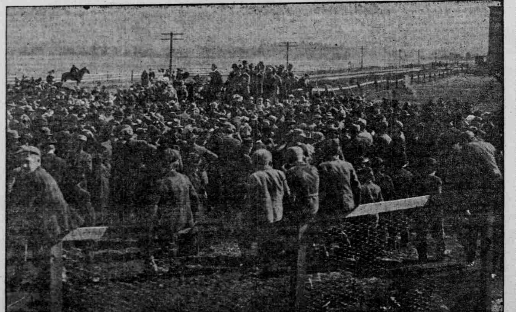
GLIMPSE OF THRONG WITNESSING DRIVING OF FIRST SILVER SPIKE.

JOSEPHINE COUNTY METROPOLIS WELCOMES GRANTS PASS & ROGUE RIVER RAILROAD, WHICH MAY BECOME THROUGH LINE TO SAN FRANCISCO.