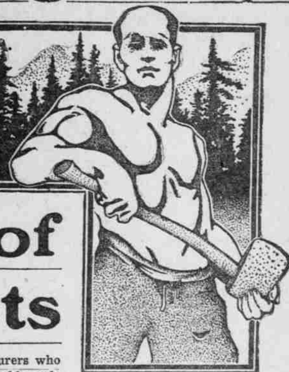
"MADE IN OREGON" From Forest to Home