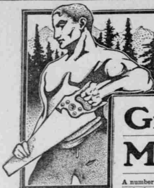
"MADE IN OREGON" From Forest to Home