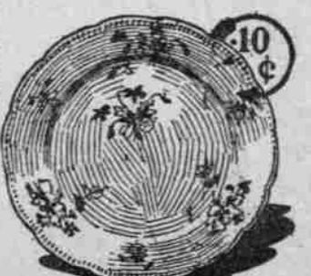
As Illustrated, 10c

One pattern is exactly as illustrated, white ground decorated in beautiful purple violets and green leaves. Plates which we ourselves sell regularly at $3 to $3.50 a dozen. See the big Sixth-street vestibule window display. Buy them Friday at only, each 10c