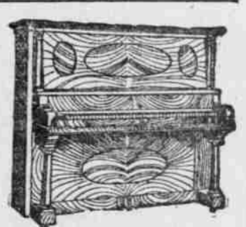
of the world's best planes. Price, $750.