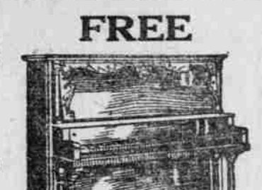
This $500 upright grand Reed-French plano.