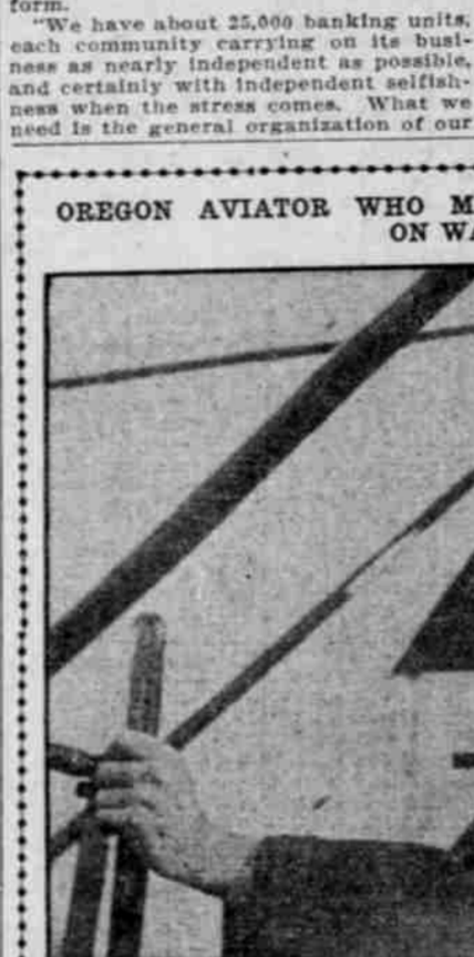
EUGENE ELY IN HIS AEROPLANE.

banking system and that organization cannot be brought about without some recognized central authority."