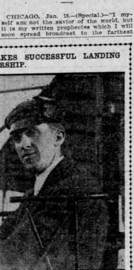
EUGENE ELY IN HIS AEROPLANE.

banking system and that organization cannot be brought about without some recognized central authority."