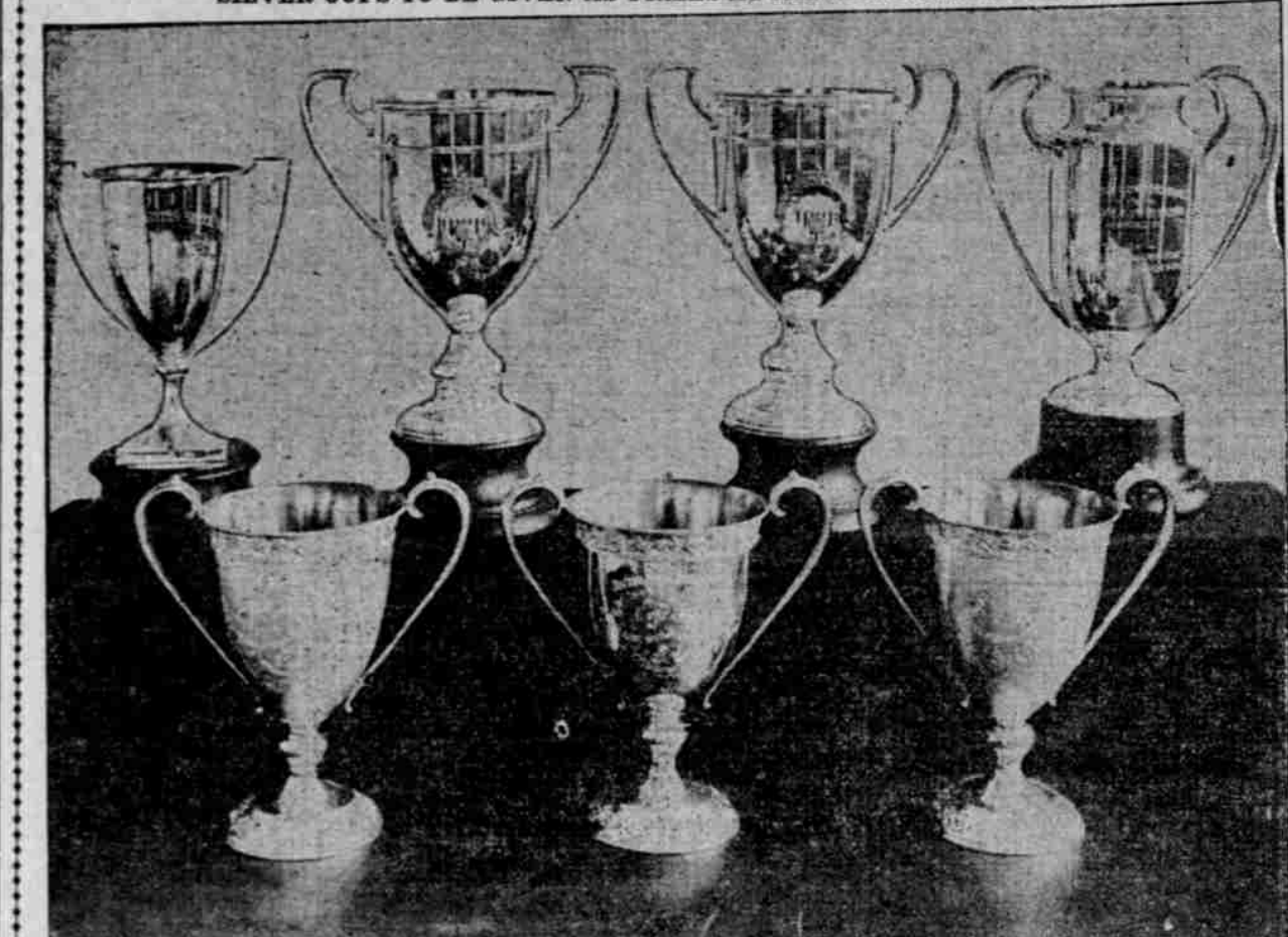
Three of the seven silver cups in the picture are given by the American Shropshire Society, the American Cotswold Society and the National Rambouillet Association. They are to be presented to the prize winners in the Mid-Winter Sheep Show, to be held at the Armory beginning next Wednesday and continuing until Saturday night.