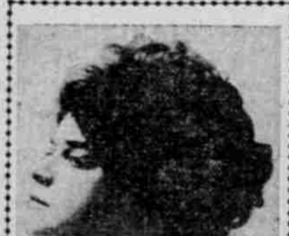
Miss Texas Guinan, comedienne in the musical play, "The Kissing Girl," at Heilig Theater.

ACTRESS and actresses invariably say that they dislike being interviewed, that it is an ordeal to be compelled to reel off platitudes, that no writer clever though he or she may be, can discover aught of the interviewed one's personality in a half-hour conversation. To prove all this, they meet the pencil-pusher more than two-thirds of the way, armed with a fat scrap-book of favorable press notices (never see any other kind in an actor's scrap-book), and a notebook in which they have jotted down a few observations. "I'd like your readers to have," or "a few things I've thought out."