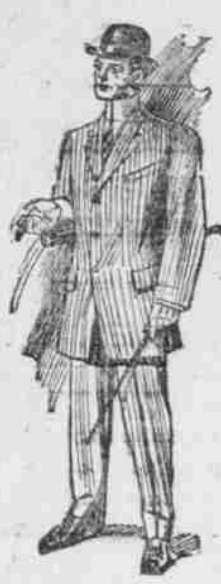
THE BEAVER HAT, $3.00

SEE OUR WINDOW DISPLAY LION Clothing Co. 166-170 Third Street