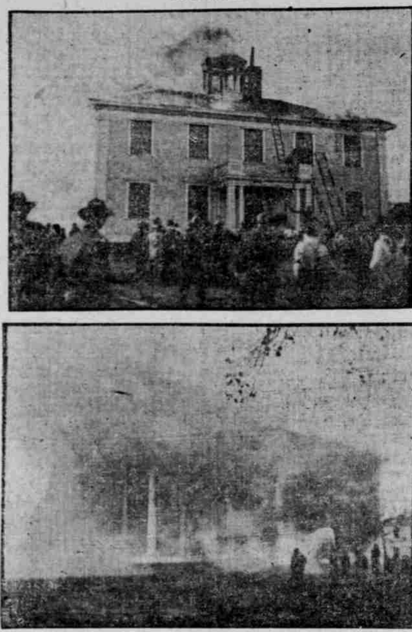
ABOVE, REAR VIEW OF STRUCTURE AT PACIFIC UNIVERSITY AS FLAMES BROKE THROUGH CUPOLA—BELOW, SNAPSHOT OF FRONT OF BUILDING ENWRAPPED BY FLAME AND SMOKE.