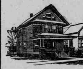
A No. 341 IDEAL Boiler and 461 ft. of 38-in. AMERICAN Radiators costing $2,000 were used to heat a house of 2,515 sq. ft. at this price the goods can be bought at any reputable competent fitter. This did not include cost of labor, pipe, valves, freight, etc., which installation is extra and varies according to climatic and other conditions.

Our catalog (free) has a wealth of concise heating and ventilating information which every owner or tenant ought to have. If you want to throttle down the fuel bills and stop the ills of old-fashioned heating, write, phone, or call today. Inquiries welcomed.