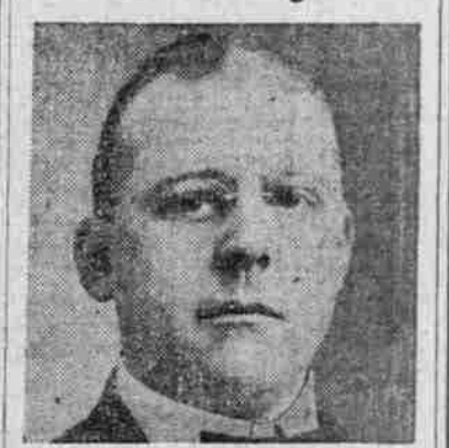
Twenty Years' Experience at Your Service.

Now is the time to have them tested by one who is thoroughly equipped for the work; who not only guarantees satisfaction but will take care of your eyes in the way of lens changes for one year from