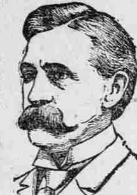
The Leading Specialist.

W. Why will women take chances with an operation or drag out a sickly, half-hearted existence, missing three-fourths of the joy of living, when they can find health in Lydia E. Pinkham's Vegetable Compound?