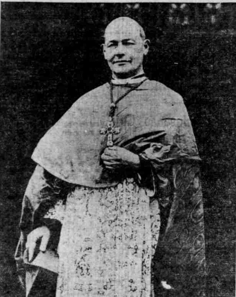
CARDINAL VINCENT VANNUTELLI