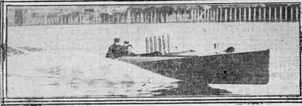
PACER-SEATTLE SPIRIT COMBINATION.