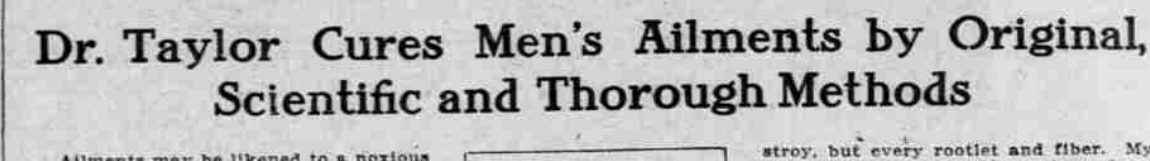
The Doctor That Cures.