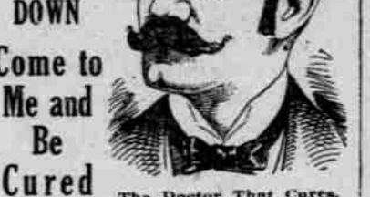
The Doctor That Cures.