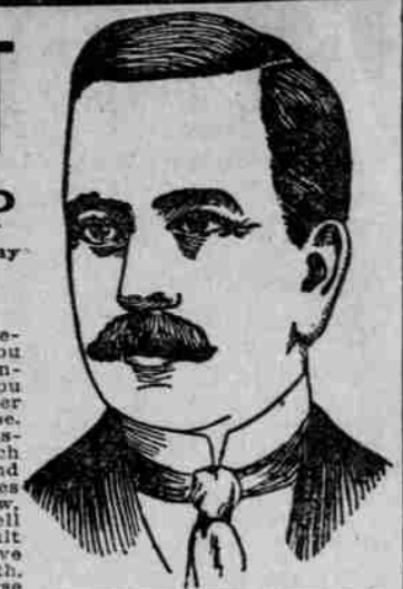
NOT A DOLLAR NEED BE PAID UNLESS CURED.

The DR. TAYLOR CO. 224 1/2 MORRISON ST. CORNER SECOND.