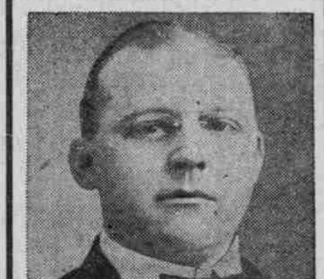
20 Years' Experience at Your Service.