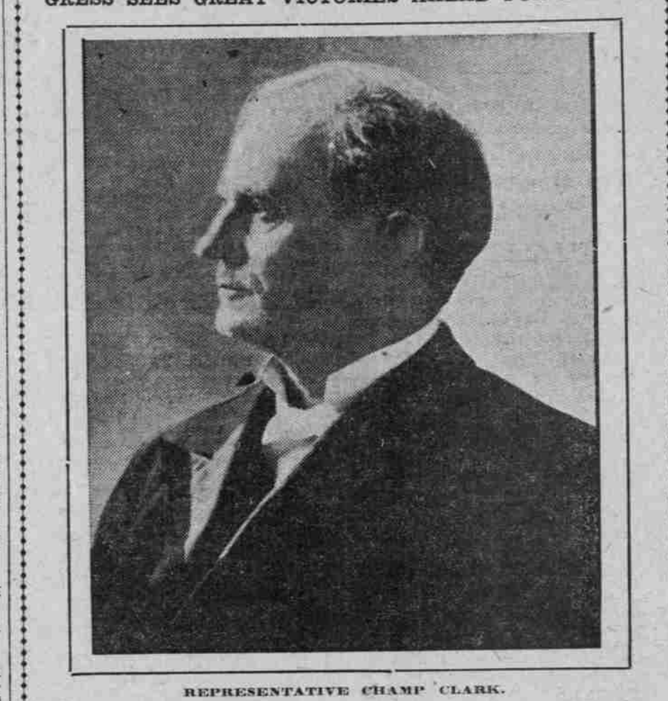
REPRESENTATIVE CHAMP CLARK.