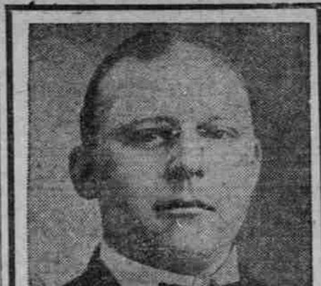
THOMPSON EYESIGHT SPECIALIST