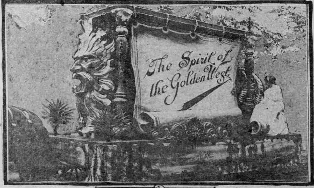
1-PENINSULA. 2-GREATER PORTLAND. 3-MERRY WIDOW. 4-SPIRIT OF THE GOLDEN WEST.

Marks looked about for her mother, find-