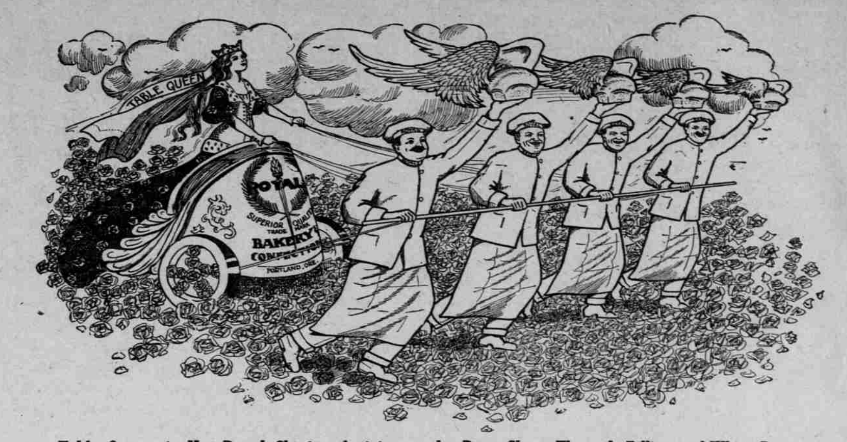
Table Queen, in Her Royal Chariot, Arriving at the Rose Show, Through Billions of White Roses

THE CARNIVAL QUEEN reigns for but a day; ROYAL TABLE QUEEN reigns 365 days in the year-her throne, in the dining-room; her royal robes, snowy table linen; her crown, golden butter, and her scepter, a bread knife. She brings to each of her two hundred and fifty thousand subjects in Portland, every day, health, strength, happiness and contentment. Her rule being light and pleasant, she is graciously welcomed by all