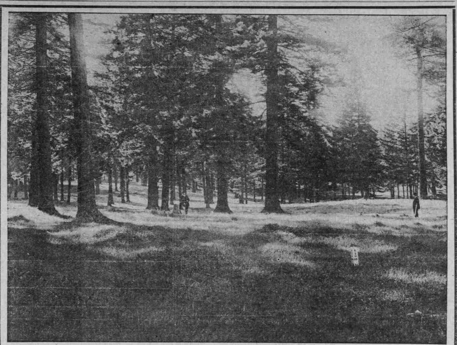
View of Ladd Park Taken from Block 95

A Healthful Hint. A bottle of the Hood Brewing Company's famous Beck Beer to ward off that tired feeling.